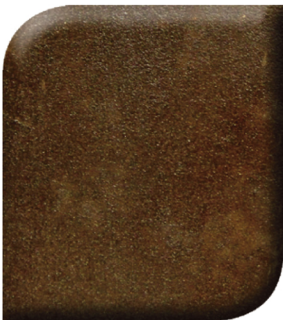
CS-14 Dark Walnut