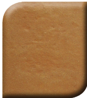
CS-16 Faded Terracotta