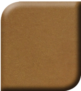
CS-2 Padre Brown