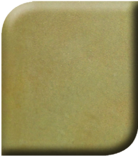
CS-12 Weathered Bronze*