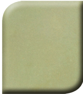
CS-11 Fern Green*