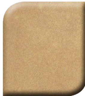
CS-15 Antique Amber